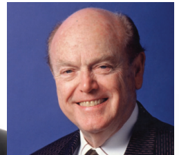
Jim Pattison Founder/Owner The Jim Pattison Group