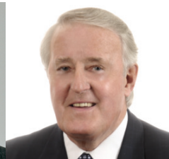
The Right Honourable Brian Mulroney Former Prime Minister of Canada Senior Partner Norton Rose Fulbright Canada LLP