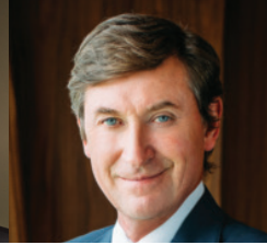
Wayne Gretzky Member Hockey Hall of Fame