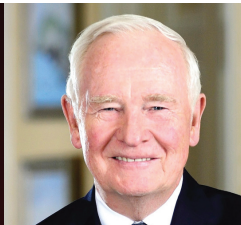
The Right Honourable David Johnston Chair, Rideau Hall Foundation 28th Governor General of Canada