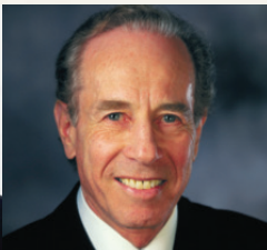
Isadore Sharp Founder and Chairman Four Seasons Hotels and Resorts